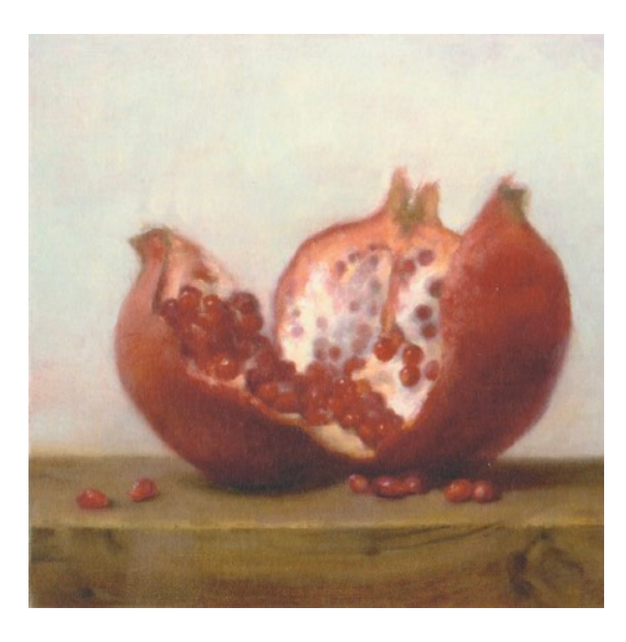
Christ Episcopal Church Roxbury, Connecticut

Third Sunday after Pentecost and Blessing of the Roofs